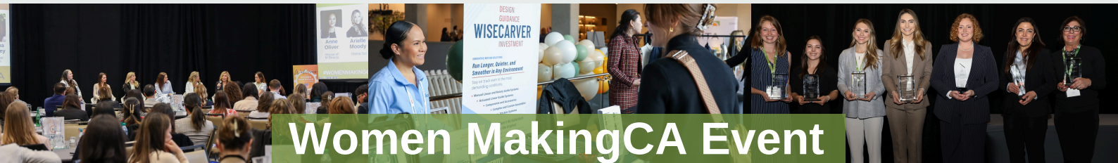
Women MakingCA Event

We provide opportunities to connect with industry peers and host events that keep you updated on the latest trends impacting manufacturers.