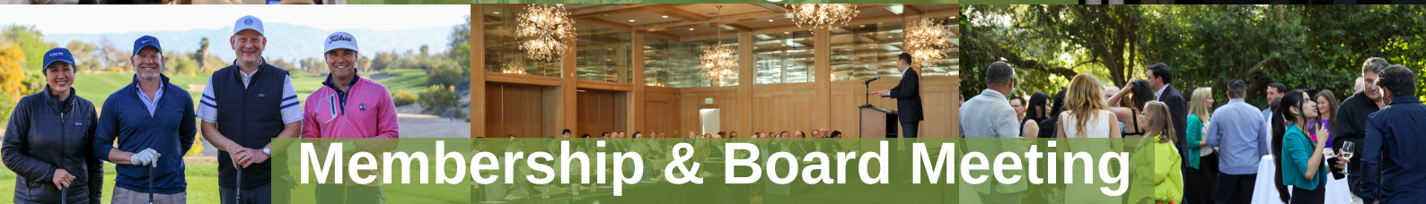
Membership & Board Meeting