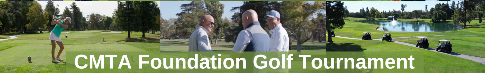
CMTA Foundation Golf Tournament